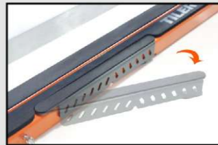
隐藏式搁架, 携带方便 Hidden supporters for easy carrying