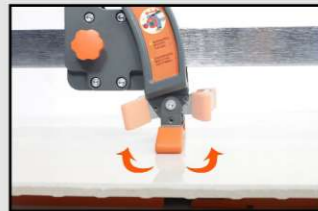
专利磁吸活动压脚, 切割方便 Patented magnetic break bar for easy cutting