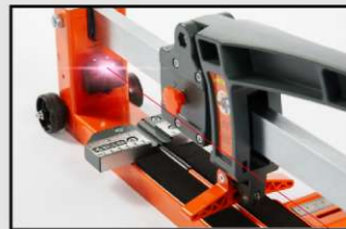
带红外线激光器, 切割更精准 Equipped with infrared laser for more precise cutting