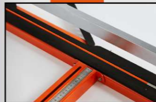
便携搁架, 螺丝定位, 安装方便 Portable supporters with screw positioning, easy to install