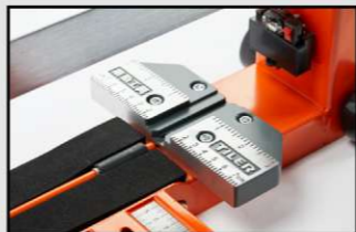
全铝靠尺, 美观精准 All-aluminum gauge, beautiful and precise