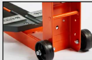
带移动轮, 移动方便 With movable wheels for easy movement