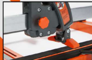
滑块锁紧螺丝, 锁紧滑块更安全 Slider locking screw for safer locking of the slider