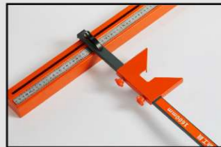
带斜角定位器, 可切割对角 With diagonal positioning device for cutting diagonals