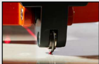
泰勒高级刀轮, 使用寿命长 TILER premium blade, long service life