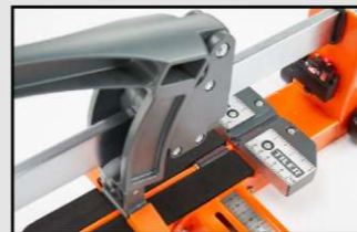
全封闭滑块, 免尘免调节 Fully enclosed slider, dust-free and no adjustment needed